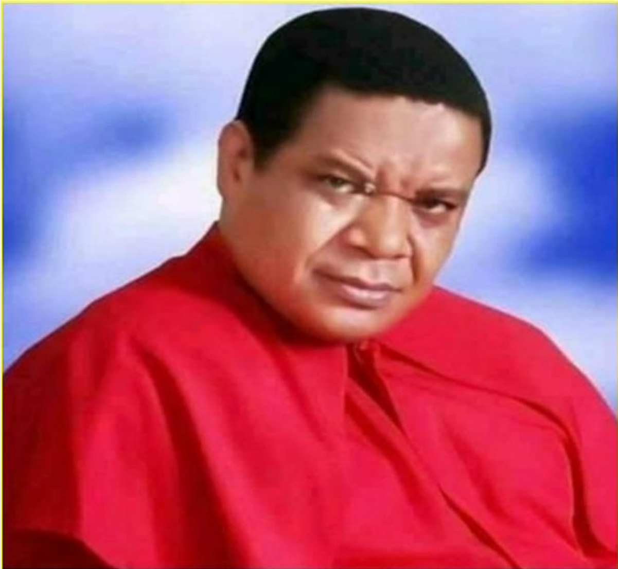
HIS HOLINESS OLUMBA OLUMBA OBU KING OF KINGS AND THE LORD OF LORDS BROTHERHOOD OF THE CROSS AND STAR 34 AMBO STREET CALABAR CROSS RIVER STATE NIGERIA